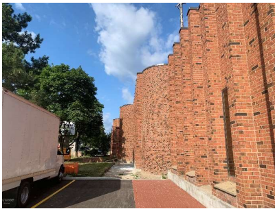
Replaced roof with new flashing, curbs, asphalt, impressed asphalt detailing, landscaping & new exterior LEDs

AFTER: NEW ROOF (10 YR WARRANTY) & FLASHING; NEW PARKING LOT AND STRIPING, NEW CURBS & SIDEWALKS; UPGRADED LANDSCAPING; NEW EXTERIOR LED LIGHTING