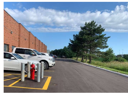
Landscape upgrades and replanting; removal of dead trees, improved hydrant location