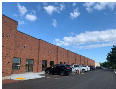
New sidewalk installation, replaced parking lot